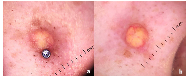
Figure 2 (a and b) Dermoscopic analysis: yellow-orange central area surrounded by peripheral erythematous border with fine linear telangiectasias.

telangiectasias, suggestive of xanthogranuloma (Fig. 2a and b).