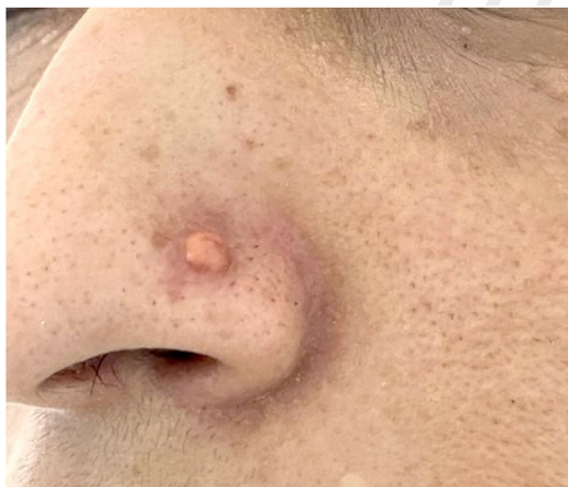
Figure 1 Small erythematous-brownish nodule adjacent to the nasal piercing.

Dermatological examination revealed small erythematous-brownish nodule, 1.5 cm diameter, similar to a keloid adjacent to the nasal piercing (Fig. 1). No other injuries have been identified. Dermoscopic analysis indicated a yellow-orange central area surrounded by peripheral erythematous border with fine linear